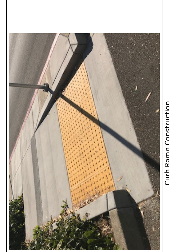
Curb Ramp Construction